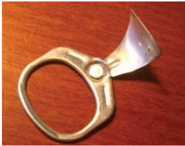
Figure 6: Frazee’s original ring-pull design