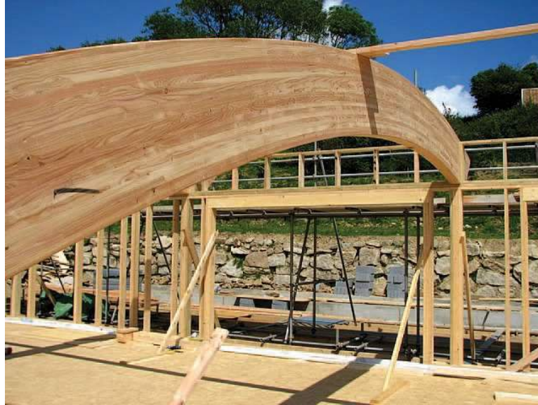
Figure 9: Glulam beam

[Image of school building in Cornwall, UK.]