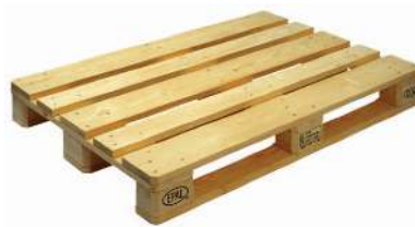
Figure 2: A European standard pallet