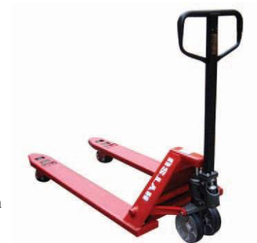
Figure 4: A pallet truck