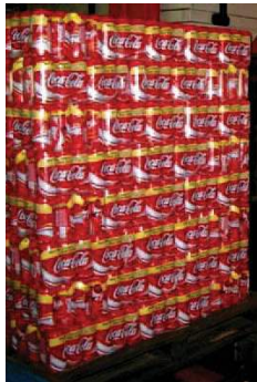
Figure 1: Drinks cans on a pallet