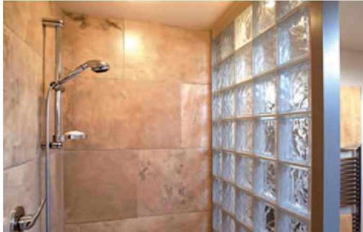
Figure 8: Glass blocks used as a shower screen

[Glass Blocks: Clear Flemish, Safewall End post silver/grey by GLASSBLOCKS.CO.UK.]