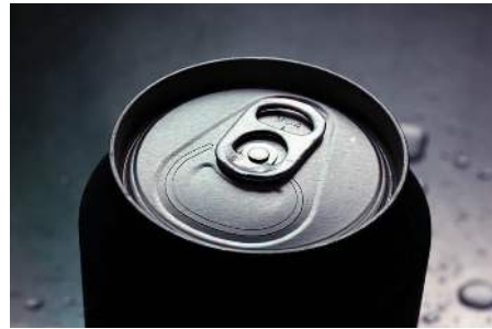
Figure 7: Cudzik’s stay-on tab design